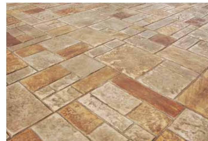
2 Stones of Athens, PD-400 47.75" x 23.875" 9-B

All stamps listed, either rented or purchased, should include a floppy tool and texture skin. The rigid quantity recommended for a set is listed at each stamp. Y-YELLOW, R-RED, B-BLUE.