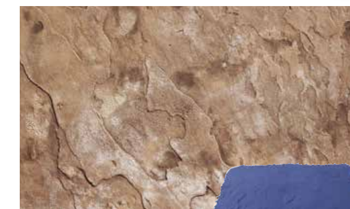
1 Blue Stone Texture A natural stone surface with a sandy texture that includes clefts which leave a layered appearance. 6 - 4' X 4'