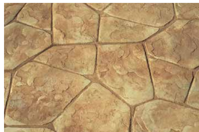
3 Flagstone, TM-700 48" x 48" (121.92 x 121.92 cm) Pattern: A and B Flagstones with hand chiseled edges grouped in a random formation 6-B