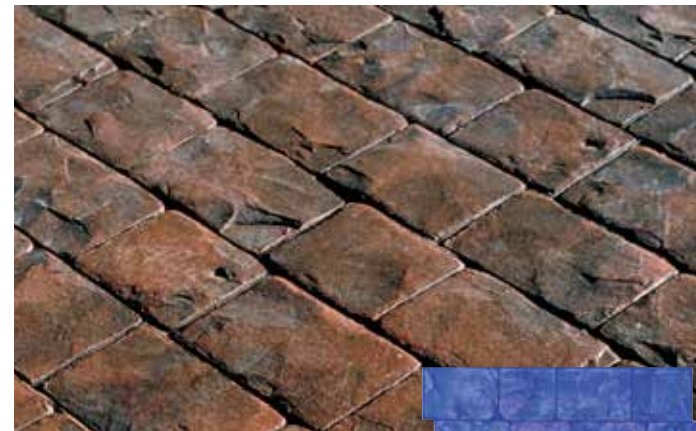
1 London Cobble, FM-540 S/O 17" x 29.75" (43.18 x 75.56 cm) Blue A traditional lightly textured cobblestone pattern 9-B