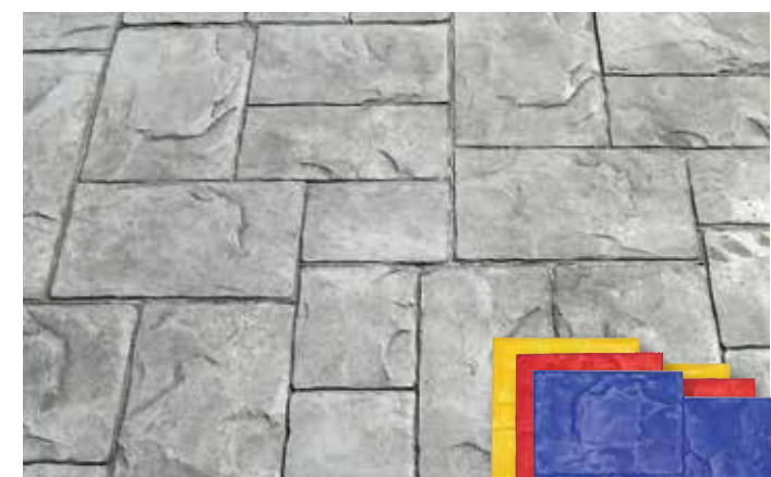
2 Ashlar Cut Slate, FM-3125 S/O 23.125" x 23.125" (58.74 x 58.74 cm) Red, Yellow and Blue A naturally laminated stone texture split along parallel planes, hand-tooled to create a more pronounced chipped fragmented texture with small deep joints 3-Y, 3-R, 3-B

Degree of installation challenge 1 being the easiest 1 2 3 4 5 5 being the most challenging