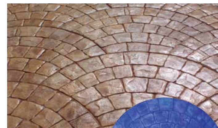
4 European Fan, FM-650 S/O 26" x 46" (66.04 x 116.84 cm) Blue An elegant European fan pattern, consisting of slightly curved rectangular slate stones 9-B