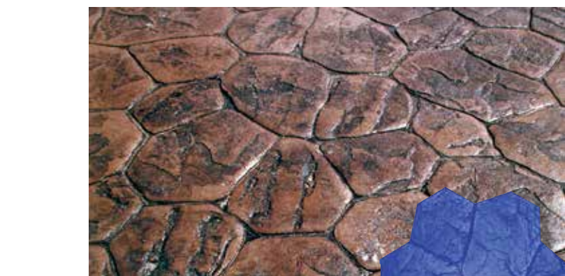
3 Random Stone, FM-700 29.125" x 29.125" (73.97 x 73.97 cm) Red, Yellow and Blue Heavily textured random fieldstones 3-Y, 3-R, 3-B