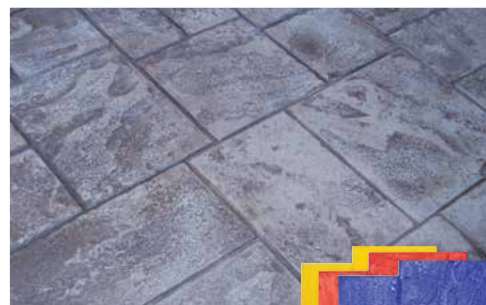
2 Rough Cut Ashlar, FM-100 S/O 24" x 24" (60.96 x 60.96 cm) Red, Yellow and Blue Rough hand-tooled stones arranged in an Ashlar pattern 3-Y, 3-R, 3-B