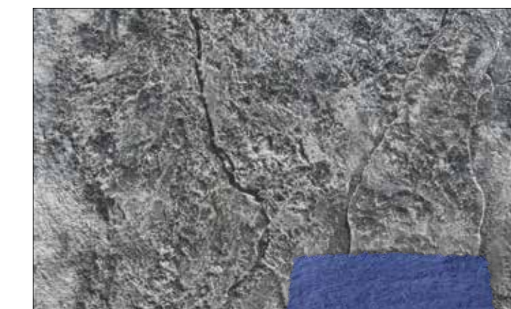
1 Rough Stone Texture A natural stone texture characterized by a continuous coarse surface with several distinguishing veins. 6 - 4' X 4'