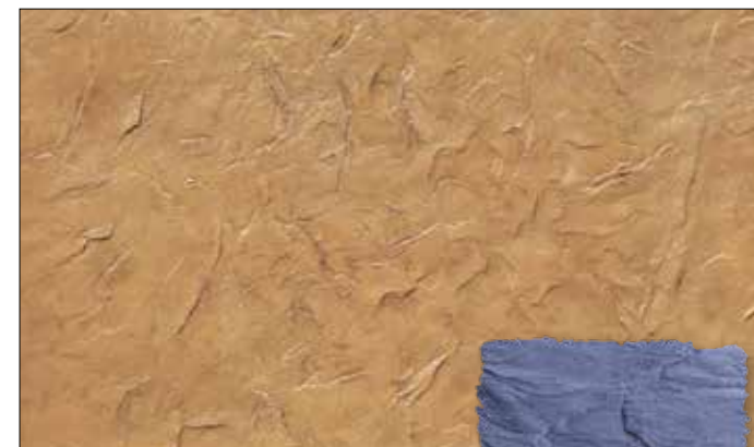
1 Roman Slate Texture A slate stone surface that utilizes dips, ridges and veins to create a continuously changing texture across the entire surface. 6 - 4' X 4'